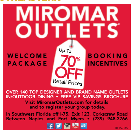
Reader Service Card #382